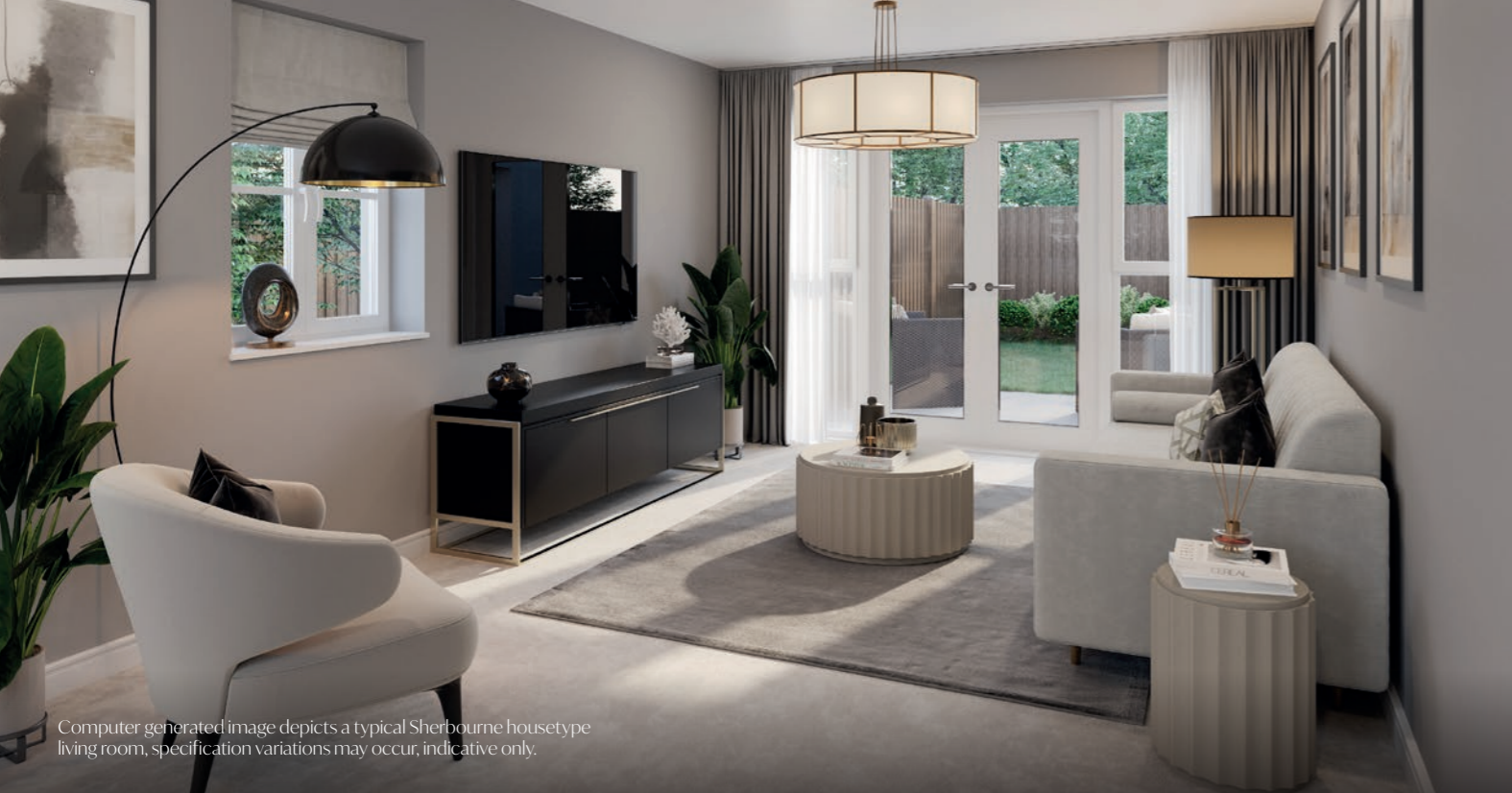
Computer generated image depicts a typical Sherbourne housetype living room, specification variations may occur, indicative only.