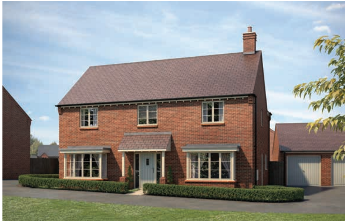
Computer generated image depicts The Harrington, plot 86, indicative only

S = Store AC = Airing cupboard W = Wardrobe